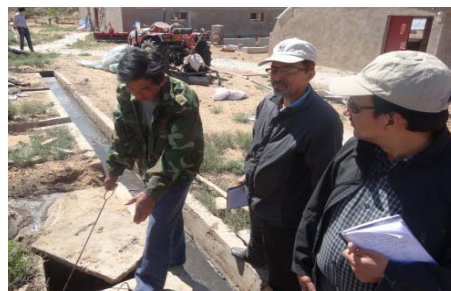
At Discussion with local farmers