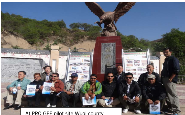
At PRC-GEF pilot site Wuqi county