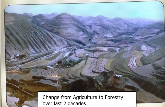
Change from Agriculture to Forestry over last 2 decades