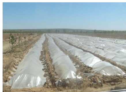
Retention of Soil moisture for agriculture crops