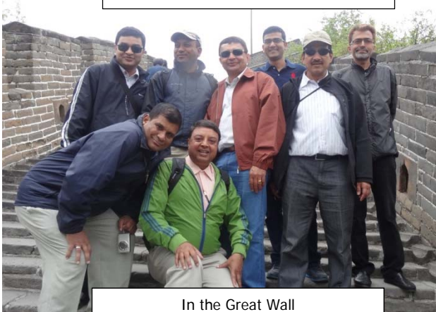
In the Great Wall