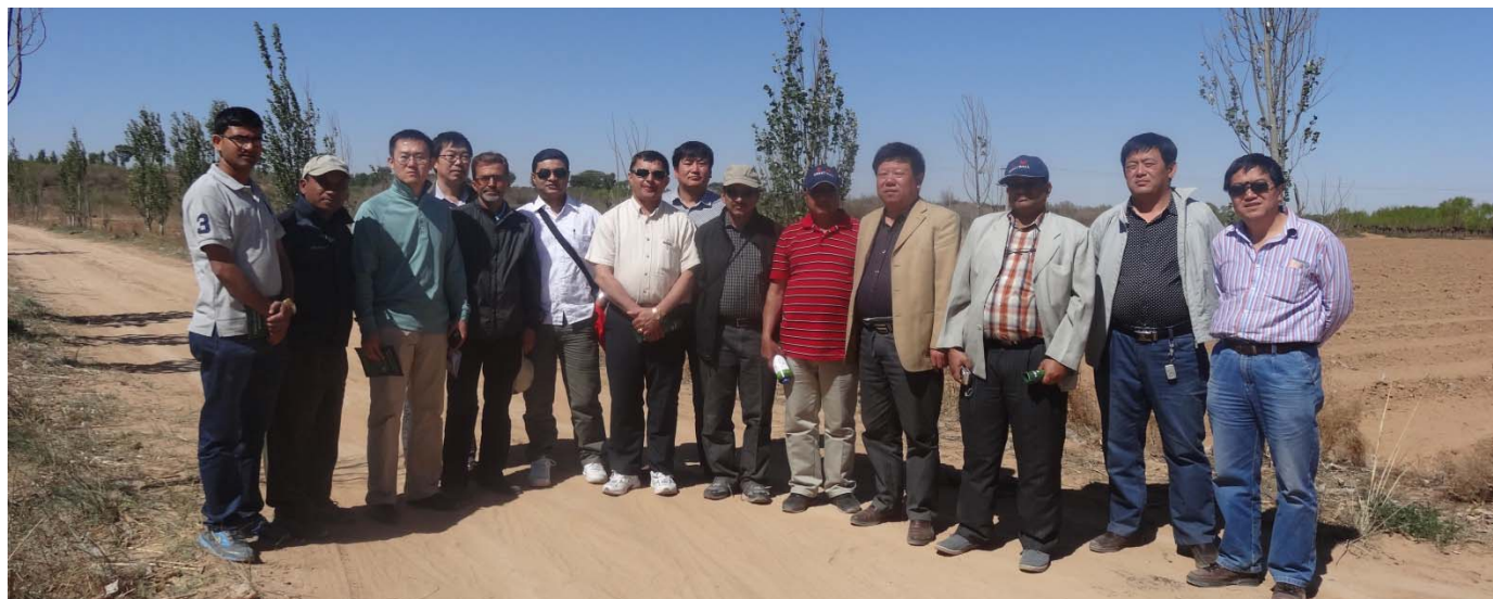
With PRC-GEF and SFA Officials, Jingbian Country, Shaanxi