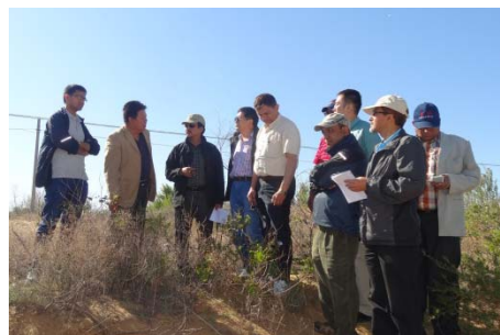
Sand Stabilization, Jingbian, Shanaxi