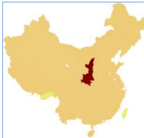
Shaanxi in China

could participate in the International Workshop on Sustainable Land Management policies and practices jointly hosted by State Forestry Administration (SFA) and