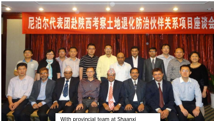
With provincial team at Shaanxi