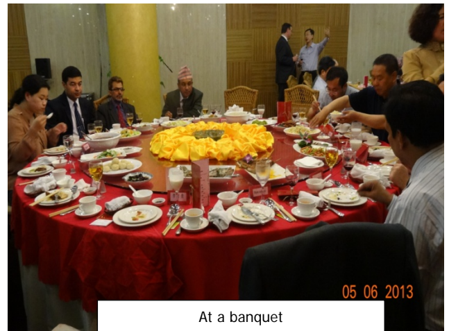
At a banquet