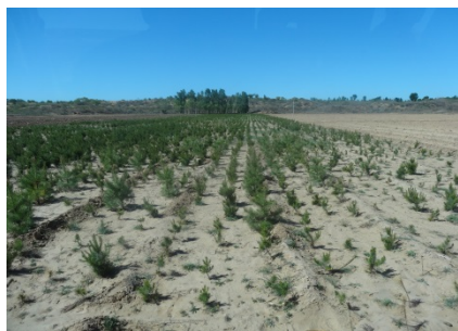
Preparing Pine ( P. sylvestris var mongolica ) seedlings at nursery