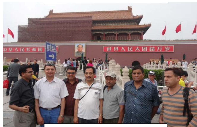
At Tiananmen Square