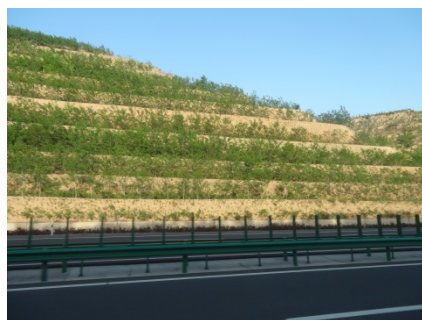
Plantation along the counter (old)