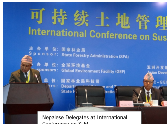
Nepalese Delegates at International Conference on SLM